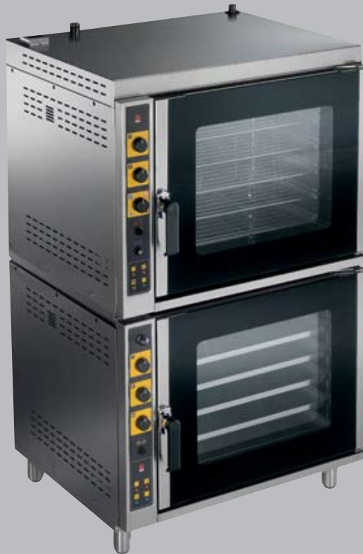
KF981 UD Double